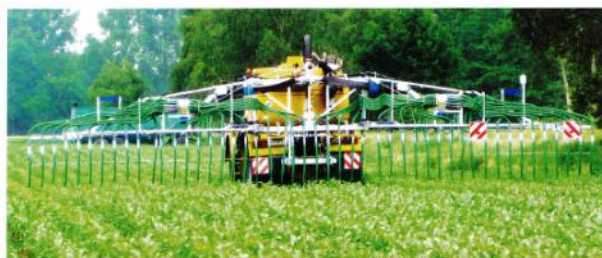
Compax – 6 to 15 m