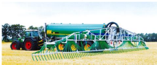
SwingMax – 18 to 33 m