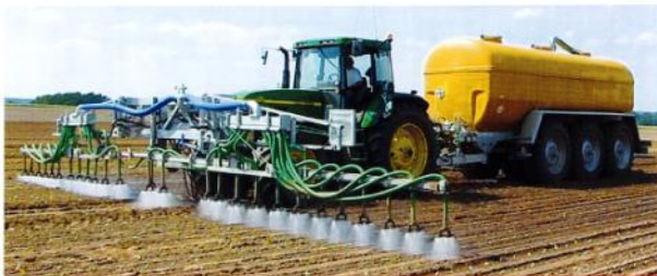
SwingFlow – 9 to 24 m