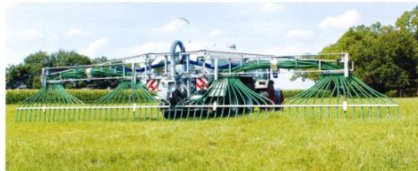
SwingUp – 7.5 to 18 m