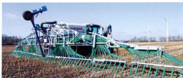
SwingDrive – 18 to 24 m