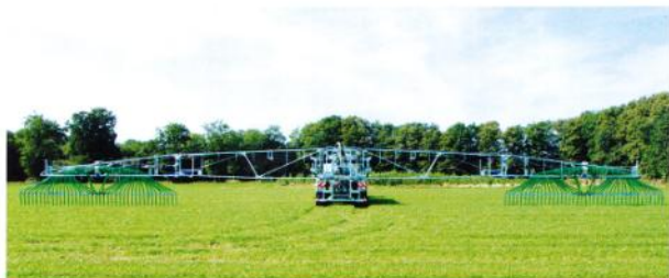
DoubleSwing – 27 to 36 m