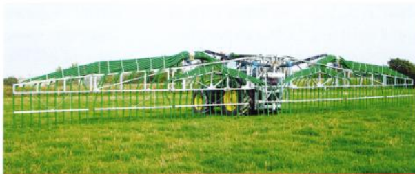
BackPac – 9 to 30 m