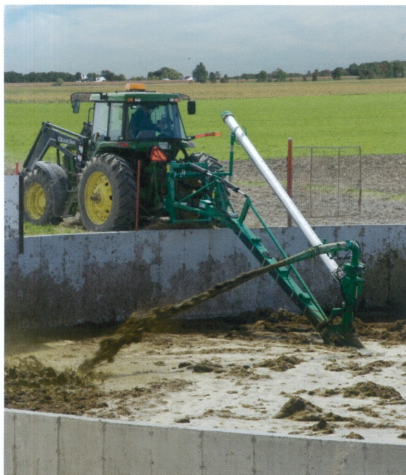
Articulated Agi-Pompe with the optional articulated housing

The Articulated Housing is a valuable, time saving option. The agitation nozzle combined with the 40° vertical rotation of the articulated housing creates enough turbulence to significantly reduce the time needed to homogenize your main storage. It can be installed on the Articulated or the Lagoon Agi-Pompe.