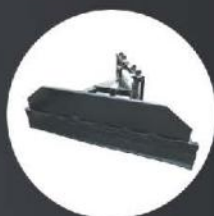
Feed Alley Scraper