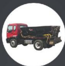
Side-Shooter Truck Mount